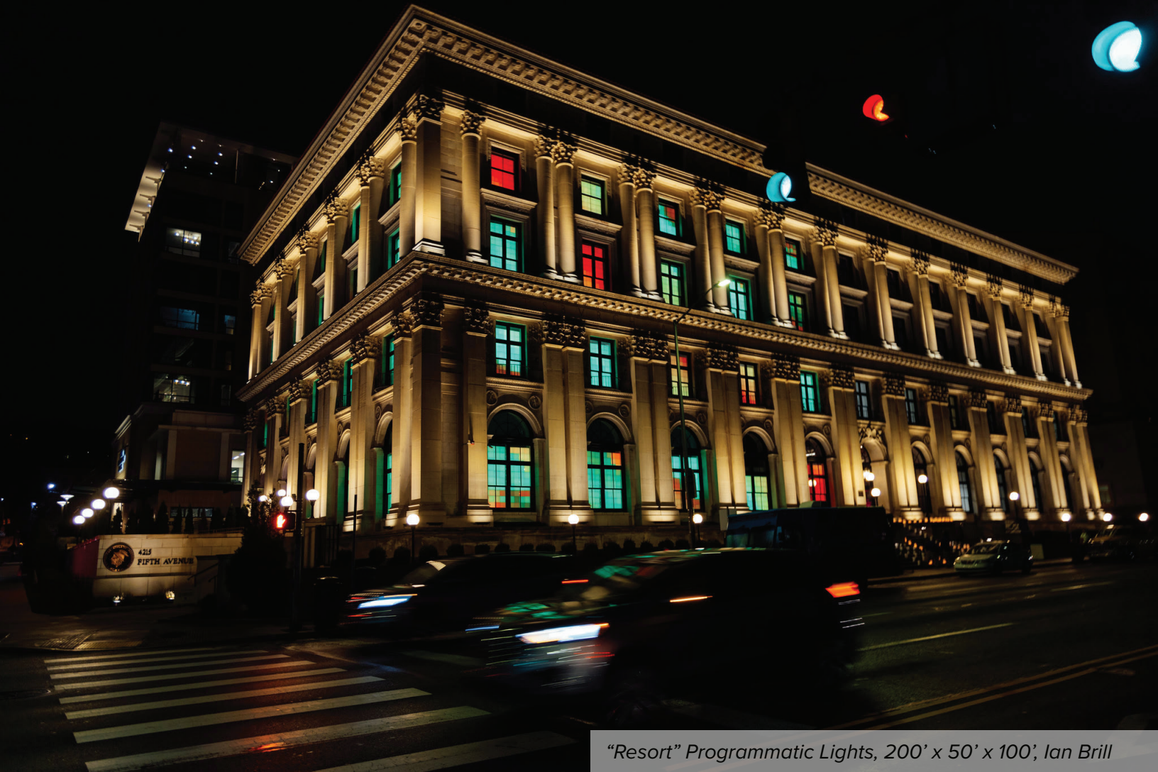
“Resort” Programmatic Lights, 200’ x 50’ x 100’, Ian Brill